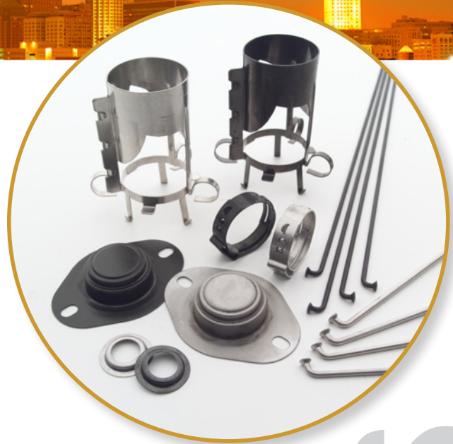
Auto light bulb shields Bicycle spokes Hose clamps Thermostat components for dryers